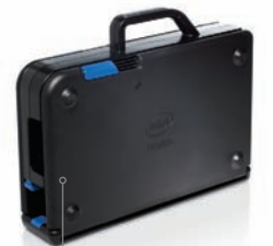
The Intel Portable Capture Station folds up for portability or storage